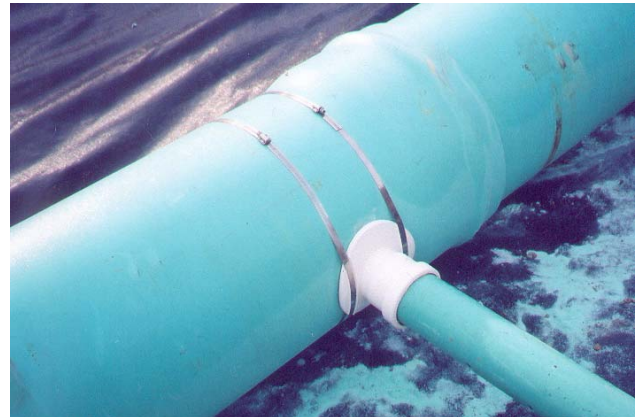
Figure 3: Pipe Saddle Connection Between Lateral Pipe and Header Pipe

Another design consideration that greatly impacts construction is the placement of the flush and underdrain plumbing in limestone. If heavy equipment passes over pipes that are not buried several feet in limestone, the pipes can be crushed. Since the Johnson Run design called for flush pipes one foot from the top of the limestone, equipment could not pass over the surface of the VFP once the flush plumbing has been placed. The construction contractor therefore chose to place all the limestone first and then excavate trenches for each lateral. An excavator was then used to place and distribute the compost (See Figure 3). The equipment retreated in this manner across the VFP until all materials had been installed. If it becomes necessary to enter the VFP with equipment to perform maintenance or to remove or add more compost, low ground-pressure equipment is recommended in order to protect the plumbing.