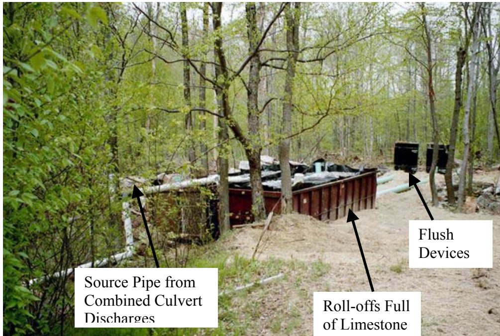
Figure 5: Jonathan Run Pilot Scale Treatment Systems

The systems were installed so that the influent flow rate, and thus the flush cycle time, could be controlled. The average retention time of the systems is half of the flush cycle, since some of the water is retained for the entire time, but the last water that enters the container is almost immediately flushed out. Table 1 shows sampling results for both containers at Jonathan Run.