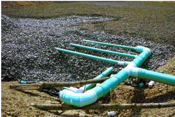
Figure 2: Johnson Run VFP During Installation

To alleviate this problem, pipe saddles can be used to connect header pipes with pipe laterals. Figure 3 shows this method of connection. These saddles are installed directly to the header pipe and do not require that the header pipes be pieced together at every lateral. Saddles can be installed at any location along the header pipe except where two joints of pipe meet. To maintain the velocity assumptions of the flushing system, the holes cut into the header pipe over which the saddles are installed must be the same diameter of the lateral pipes.